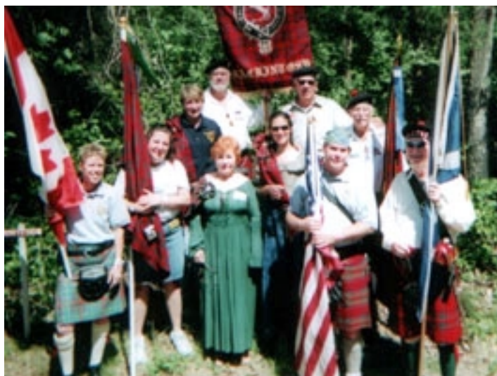
Clan Mackintosh gathers for the parade of Tartans at the Loch Norman Highland Games in Huntersville, North Carolina.

A number of clan members extended our social by gathering for dinner Saturday evening at a local restaurant.